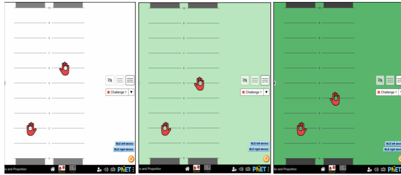
Figure 2: The visual display for the PhET Simulation, Ratio and Proportion , with hand positions far from (left), close to (middle) and at (right) the target ratio (1:2). The background changes from white (left) to dark green with increasing saturation (middle and right) as the target ratio is approached.

heights corresponding to the selected challenge ratio, the simulation provides visual and auditory feedback (background turns green, a confirmatory chime plays, and if enabled, speech description voices “hands at challenge ratio”). When hands approach the challenge ratio, visual and auditory feedback support learners’ awareness of this proximity (background becomes more green, the tempo of a plucking sound increases, and if enabled, speech description voices “hands very close to challenge ratio” and “hands extremely close to challenge ratio”).