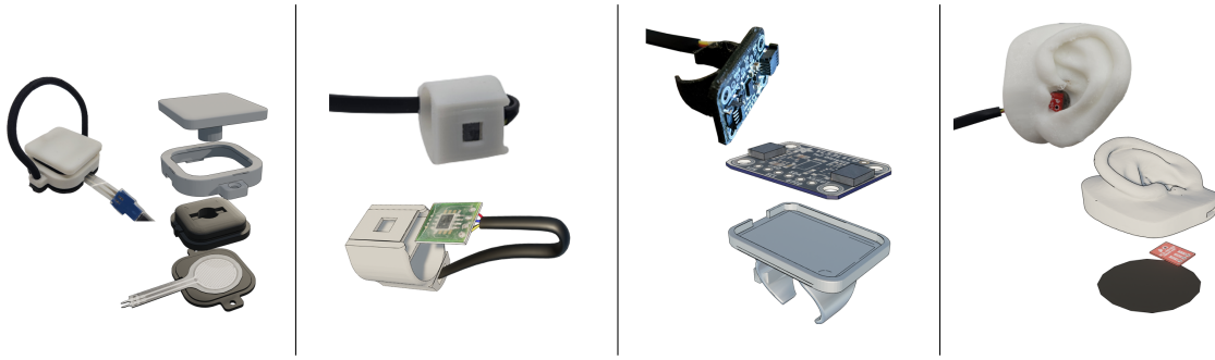
Figure 4: (a) Weight, (b) Magnetic Field, (c) Distance, and (d) Frequency sensor units.

distance sensing rings (we provided a single size), and uncertainty about the way to wear the magnetic field sensor and the distance sensor ring. Participants reported confusion when the device form factor did not align with their interaction expectations. For example, one participant tried using the weight sensor on a table, rather than on their palm, and indicated that the elastic band made it difficult to use in this context.