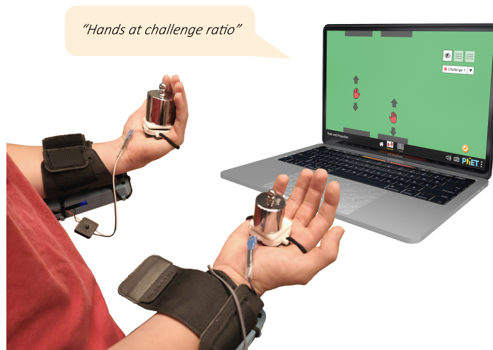
Figure 1: Participant uses weight sensory extensions to control Ratio and Proportion simulation

Ann.Eisenberg@colorado.edu University of Colorado, Boulder Boulder, CO, USA